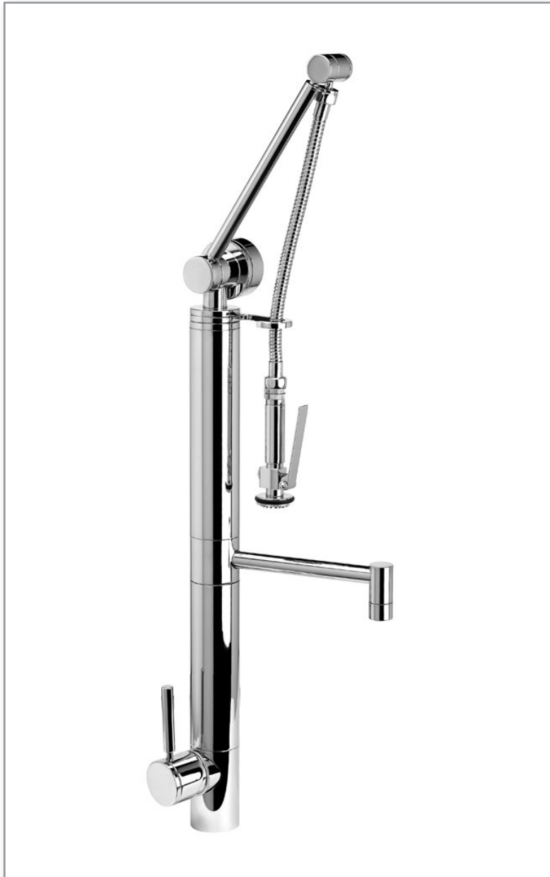
Finish Shown - Chrome